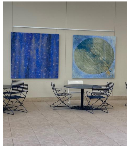
Paintings by Denise Driscoll at 100 Tech Square.